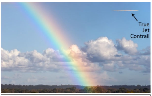
True jet contrails are rare, like rainbows.